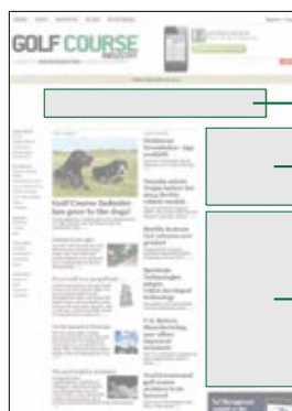
Leaderboard 728x90 pixels